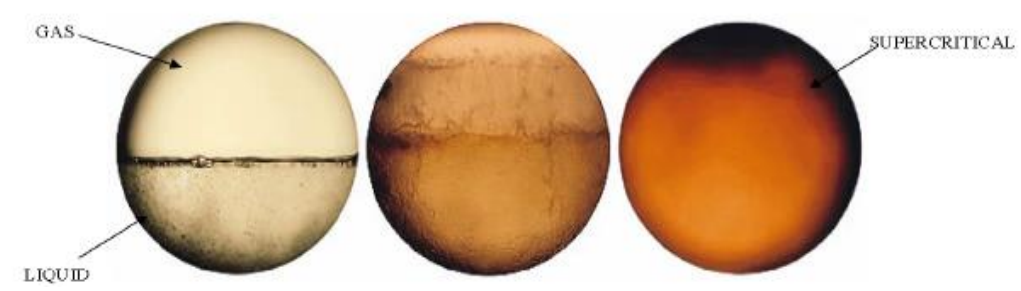
Fig. 2 The phase state change process of supercritical phase

As shown in Figure 2, the phase change process of supercritical carbon dioxide in the interface between gas and liquid phases gradually disappear and eventually become a single supercritical phase. Therefore, supercritical carbon dioxide is not only different from the gas, but also different from the liquid. The physicochemical properties of it are between the gas and liquid.