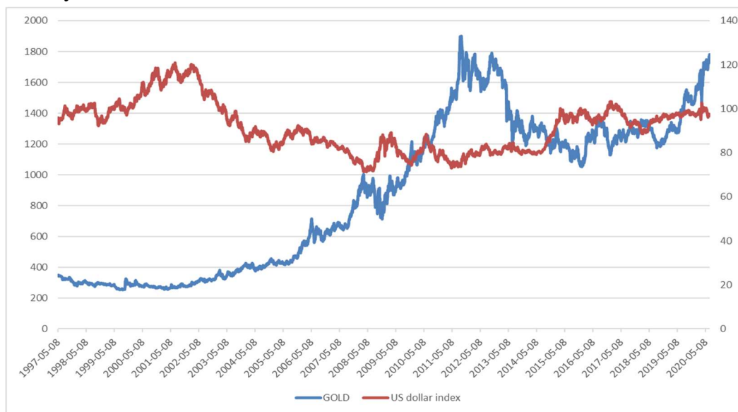
Figure 3. Gold and US dollar index

As gold is a hard currency and it has the function of avoiding currency devaluation. Theoretically, the depreciation of US dollar will lead to the rise of gold price, while the appreciation of US dollar will lead to the decline of gold price. In Figure 3, by comparing the relationship between the London Gold and the US Dollar Index, we can also find an obvious top-back separation relationship. Of course, because gold also has the function of hedging, the reverse relationship between gold price and the US dollar index may be disturbed.