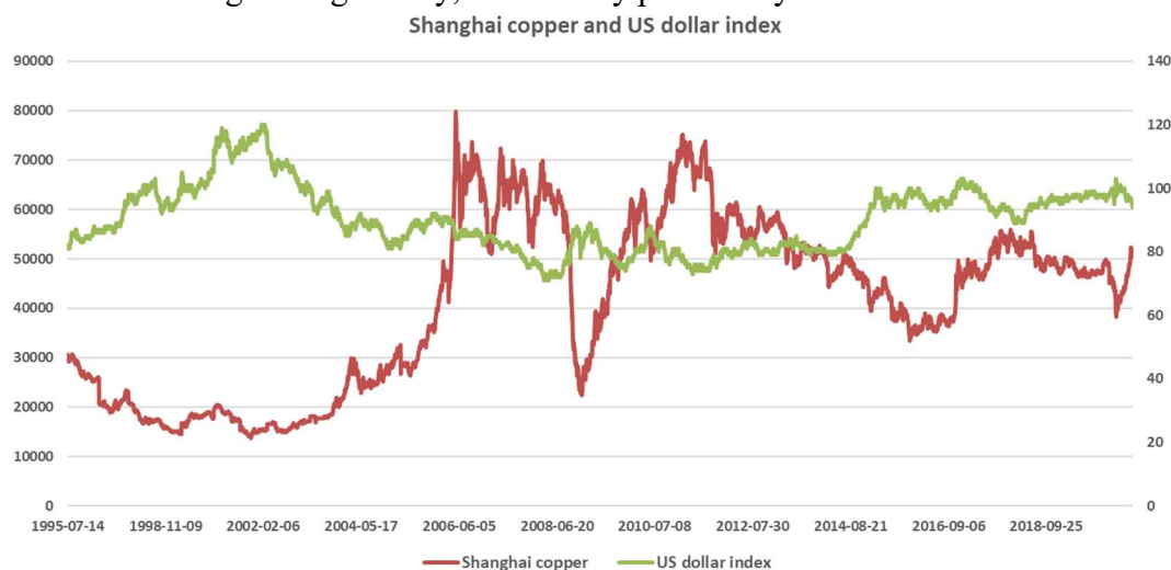
Figure 2. Shanghai copper and US dollar Index

The US dollar is at the core of the international monetary system, accounting for 60% of the world's foreign exchange reserves and about 40% of the international trade settlement currency market. Therefore, the US dollar is the pricing currency of the world's major commodities. Bulk commodities mainly include three categories, namely agricultural and sideline products, basic raw materials and energy commodities. These commodities are the lowest level raw material in industrial production, and the supply is limited. Therefore, the monetary effect of "rising tide and rising ship" will be reflected in the price of bulk commodities most quickly. When the Federal Reserve starts quantitative easing to stimulate the economy, commodity prices around the world will rise sharply, and when the Federal Reserve starts tightening money, commodity prices may fall.